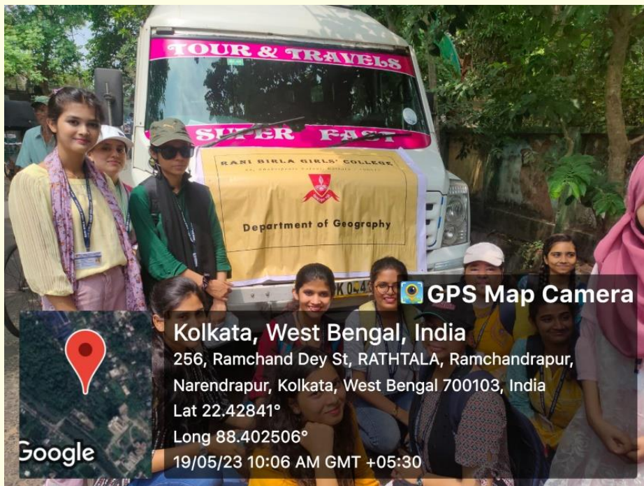
Students with teachers at Chintamani Kar Bird Sanctuary