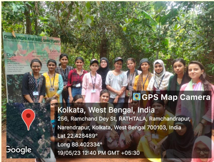
Students with teachers at Chintamani Kar Bird Sanctuary